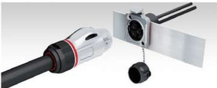
Power with board mounting