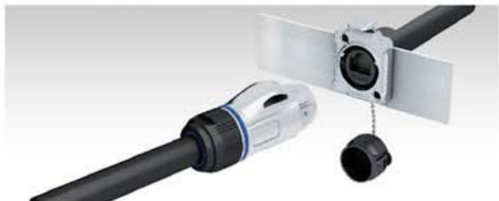
RJ45 with board mounting